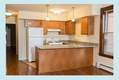
After Kitchen at Park Terrace